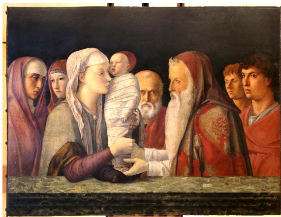
Presentation of Christ in the Temple - Bellini